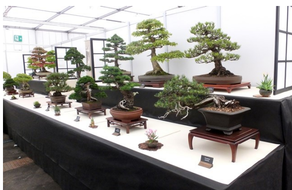
The entire stand

This years' stand consisted of a central tokonoma containing a large and sculptured juniper with a mountain scroll and similarly following the mountain concept, a suiseki mountain stone on a stand. On either side of the tokonoma were 12 feet extensions on 2 levels exhibiting trees and accents. A very worthy stand, deserving of its' top class award and greatly admired by the many thousands attending the event.