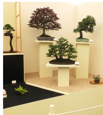
Cheshire Bonsai Society