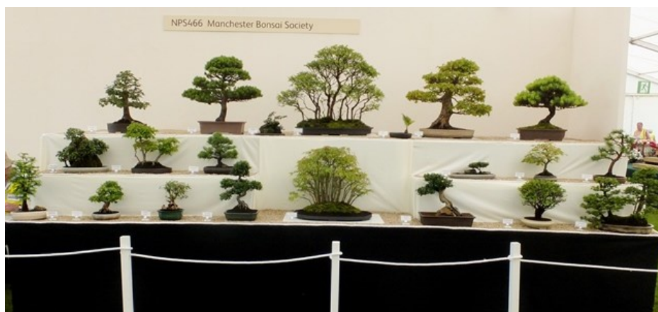
Manchester Bonsai Society