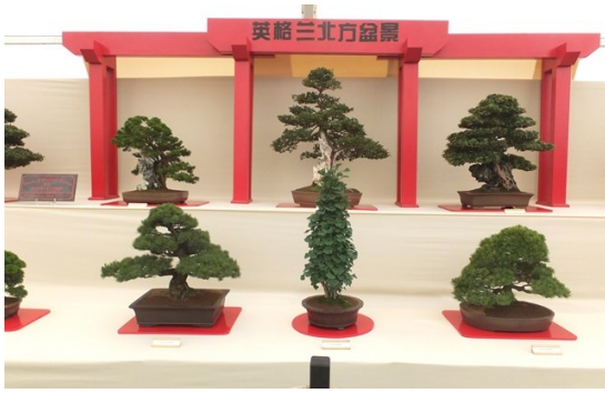
North of England Bonsai